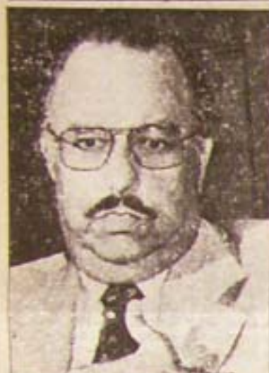
Nicaraguan President ANASTASIO SOMOZA