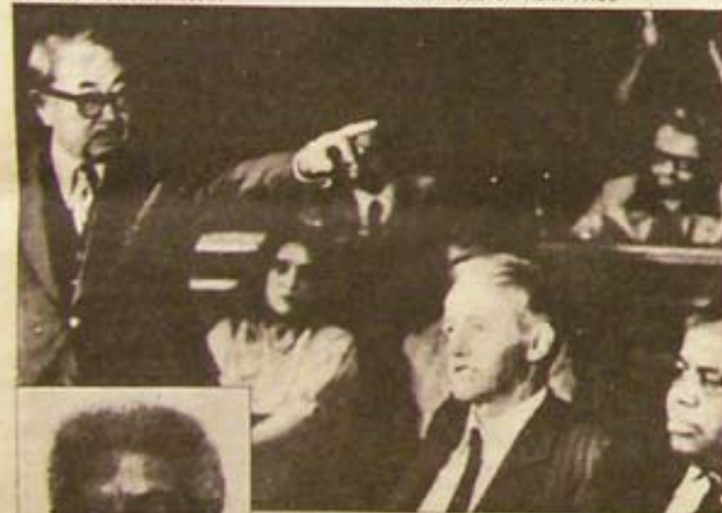
Right-wing California Senator S.I. HAYAKAWA (left) exhorting his colleagues to support the Rhodesian government during former "Prime Minister" IAN SMITH'S (center) 1978 visit to the U.S. Black puppet leader Rev. NDABANINGI SITHOLE (right) and BAYARD RUSTIN (inset).

An editorial in the January, 1977, issue of the Wall Street CONTINUED ON NEXT PAGE