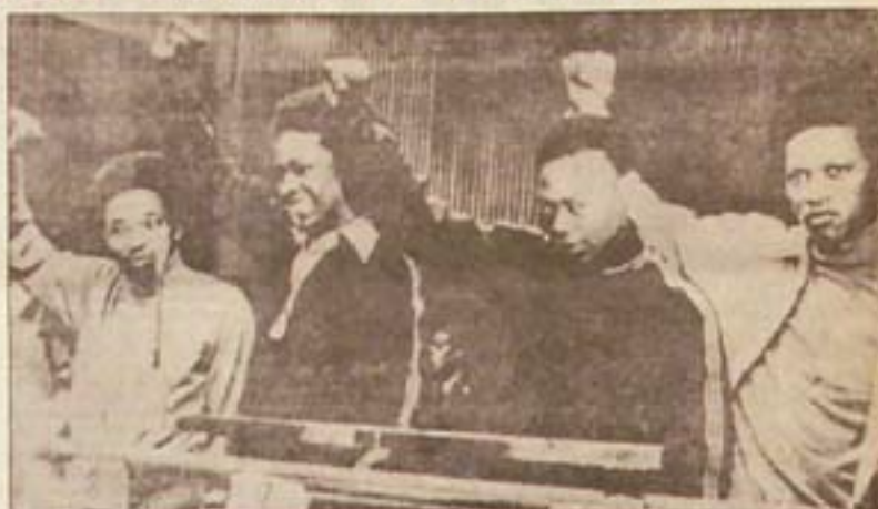
Before their sentences were announced, four of the Soweto student leaders gave the Black power salute.

The White minority regime has thus far refused to accept pro-