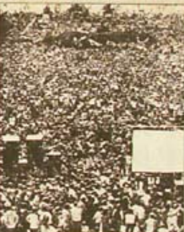
Some of the 125,000 protesters at the May 6 anti-nuclear demonstration in Washington, D.C.

Rustin also supported the South African invasion of Angola. □