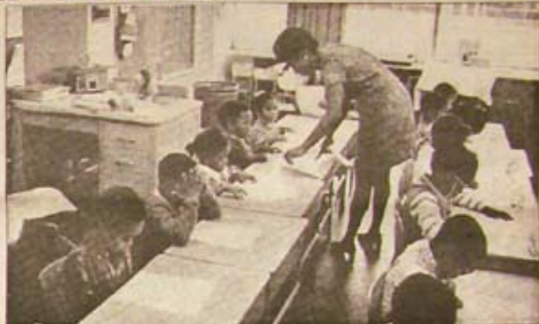
Black and poor children in America have always been denied quality education. The proposed mass layoff of San Francisco teachers will hurt Black and poor students the most.

In the proposed remedy, attrition which includes regular retirement and resignations and is estimated at 250 workers each year, saves enough money to pay 425 teachers. Early retirement would release an additional 130