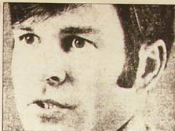
The Bay Area establishment press has been sympathetic to DAN WHITE, (above) the confessed assassin of San Francisco Mayor GEORGE MOSCONE (top left) and Supervisor HARVEY MILK.