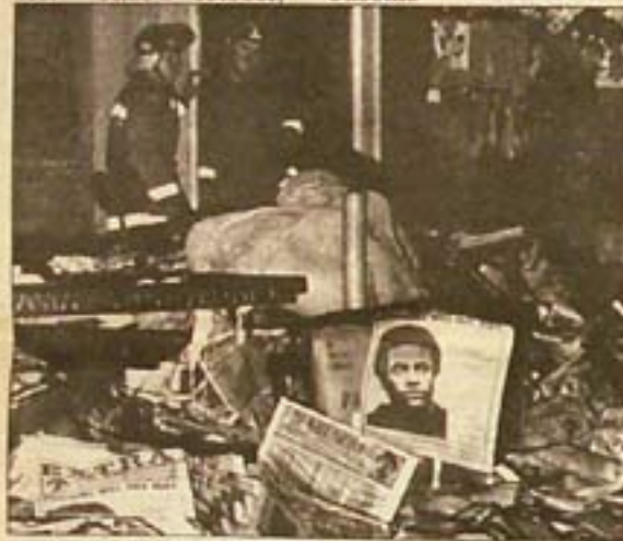
BLACK PANTHER newspapers were burned in a COINTELPRO operation in San Francisco in 1971.

Although the FBI's own memos since 1972 are especially hard to come by, it is apparent that media manipulation and the use of informers and agent provocateurs is still very much a part of the FBI's intelligence operation. COINTELPRO lives on. □