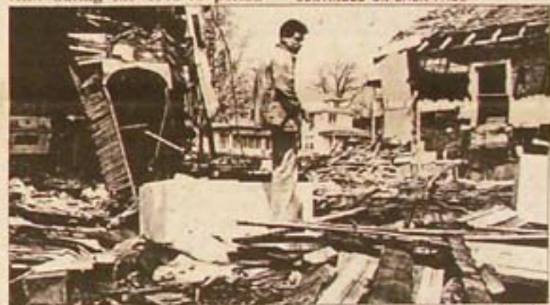
The Des Moines, Iowa, BPP office was totally destroyed by a bomb blast in 1970.